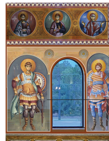
Full Body Saints